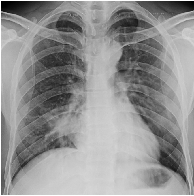
Figure 2: Chest x-ray PA view- (after 2 weeks of high dose intravenous steroids for 4 days) – Image 2